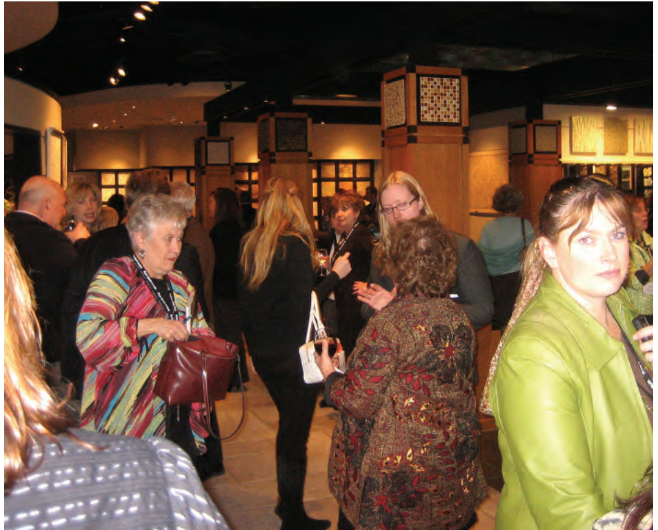
Evening reception held at Walker Zanger showroom