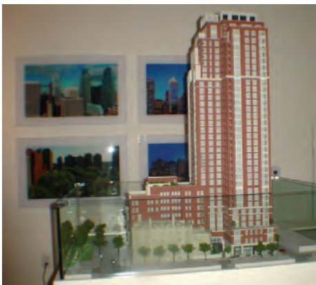
Scale model exterior view

The event concluded in the unit that currently serves as the sales office. Our hosts provided refreshments and we all had the opportunity to share our thoughts and ask questions about the project. This tour was so popular that we are attempting to arrange a similar experience. If the arrangements can be made it will probably occur before the next edition, so watch your email blasts for details!