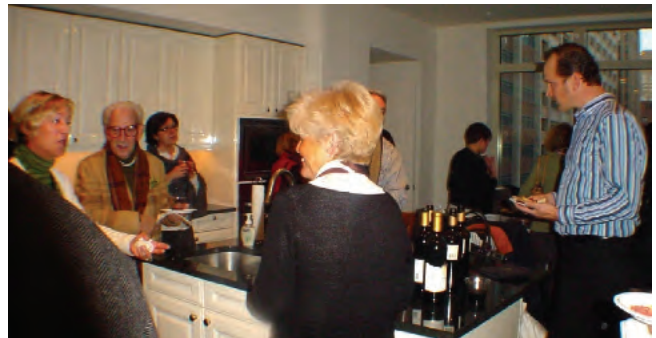
Enjoying Refreshments in the Kitchen