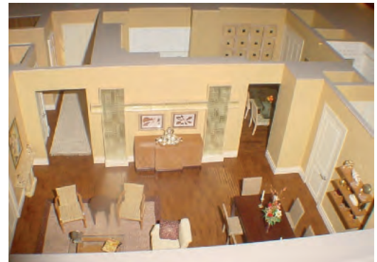
Scale Model interior view

The event concluded in the unit that currently serves as the sales office. Our hosts provided refreshments and we all had the opportunity to share our thoughts and ask questions about the project. This tour was so popular that we are attempting to arrange a similar experience. If the arrangements can be made it will probably occur before the next edition, so watch your email blasts for details!