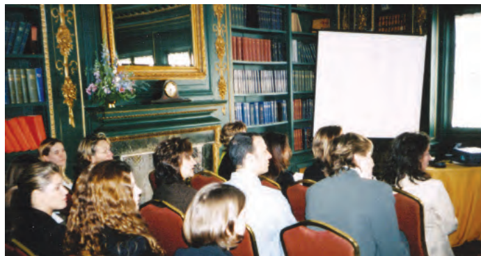
Students in the audience - Student Career Day at Pen Ryn Mansion.