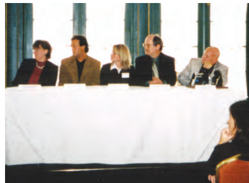
A panel of ASID professionals answers students' questions, during Student Career Day at Pen Ryn Mansion.

room. Both of these gentleman are still active IP representatives of the PA East Chapter. These programs demonstrated to members that the Industry Partners in their market areas are sources of information and ideas, not simply sellers of product.