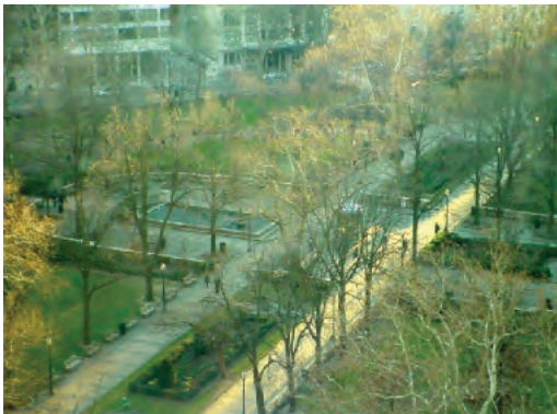
Many of these units include extraordinary views. The first residence we visited looked upon Rittenhouse Square.